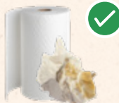
Paper towel & tissues