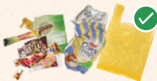
Plastic bags, soft plastic packaging & food wrappers