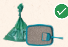
Kitty litter and animal waste