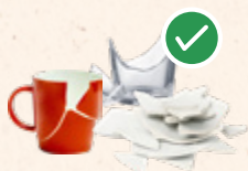
Broken glassware & crockery