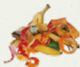
Fruit & vegetable scraps