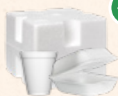
Bagged polystyrene & foam