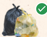
Bagged general rubbish