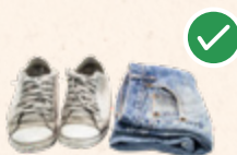
Old clothing, shoes & textiles